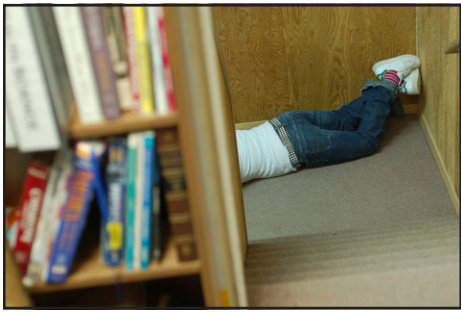
A student hangs out in the library. Although most of their days are structured, students still have some down time.

program in Georgia, and when he got in trouble there for lying, he made a choice to set his life back on track. "I was sick and tired of being sick and tired," he said. The opportunity to work with his parents as he goes through the treatment program has been the best part of his Montana Academy experience so far. He's also getting in touch with his emotions. "I'm more of an intellect, but I've been working on feeling more," he said. "I met a friend here who's more emotional. We help each other out."