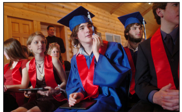
Graduation Day recognizes students' completion of the emotional growth program. Some students earn their high school diploma as well.